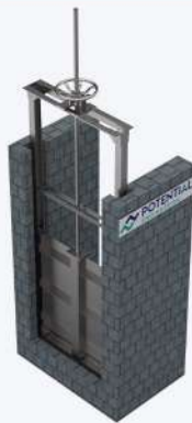
Open Channel Gate