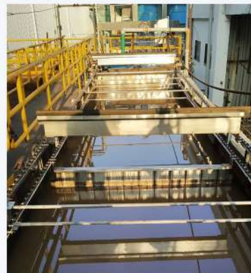
Chain Scraper System